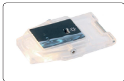
lighting cover plate (optional)